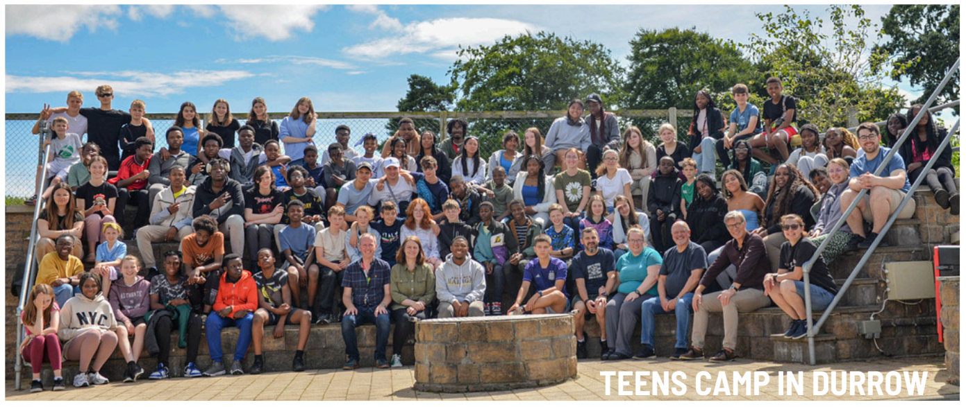
TEENS CAMP IN DURROW

Thank you for praying for the Teens Camp at the FM Centre in Durrow, Co Laois. We had 69 campers (age 12-16) and it was a tight squeeze with leaders too. The theme of this week was " Encounter "- people who encountered Jesus. We pray many of these young people will encounter Jesus and live transformed lives! In the evening we looked at relationships (Connections) with those around us. It was a very multicultural camp with different languages heard at different times throughout the day (and night!). It's amazing that we can all come together around God's word and worship Him. The gospel is what unites us.