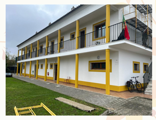
One of the work teams

In our last prayer letter we mentioned the planned renovations to the Vendas Novas Camp Centre in Portugal. Thank you to those who have generously given finances towards the work and organised the work teams. There were two consignments of materials transported from Northern Ireland to the camp centre. These included new beds, timber, bedding, mattresses, stainless steel kitchen equipment, electrical wiring, lights, a fire alarm system, tools and many other materials required for the work.